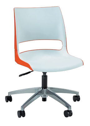
DŌNI - 24/7