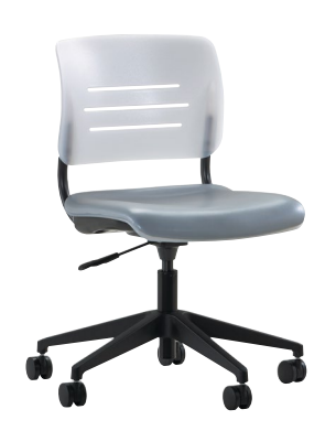
GRAZIE - 24/7