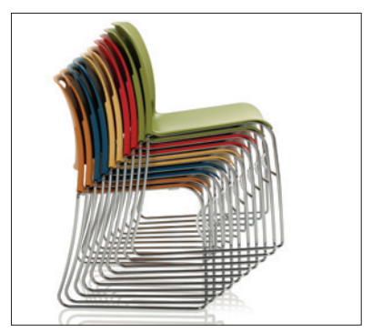
Stack Maestro 10-high on the floor or stack poly chairs 38-high and upholstered chairs 15-high on a dolly.