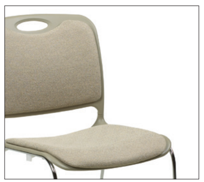
Upholstered seat and back pads provide extra comfort and a more refined look, yet still have high-density stacking capabilities.