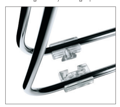
Ganging or non-ganging glide options accommodate any flooring surface – from carpet to tile to wood – and any application.

Learn more about Maestro High-Density Stack Chair