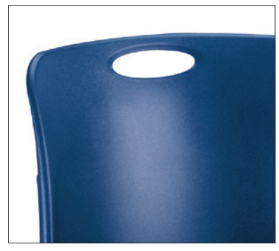
Integrated handle in the seat back allows for easy lifting, moving and stacking.